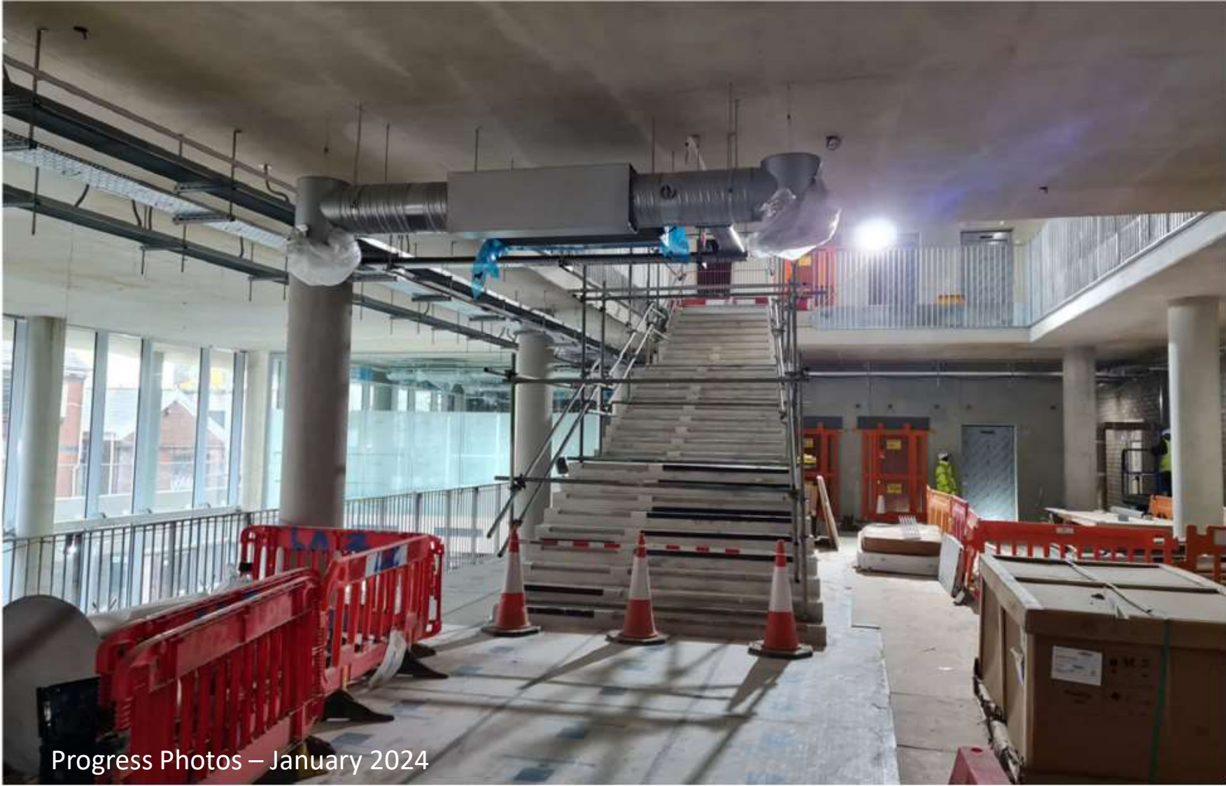
Progress Photos – January 2024