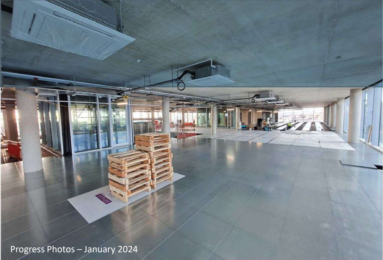
Progress Photos – January 2024