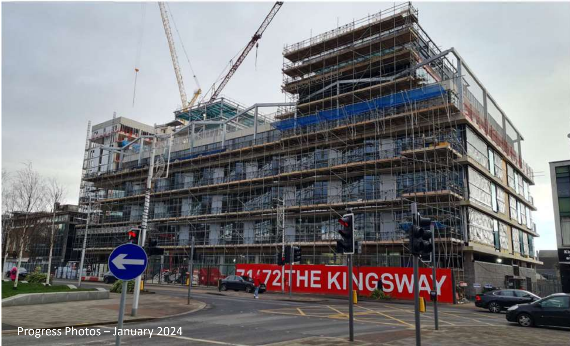
Progress Photos – January 2024