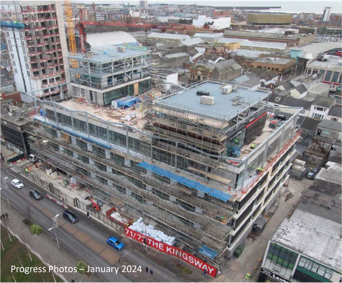
Progress Photos – January 2024