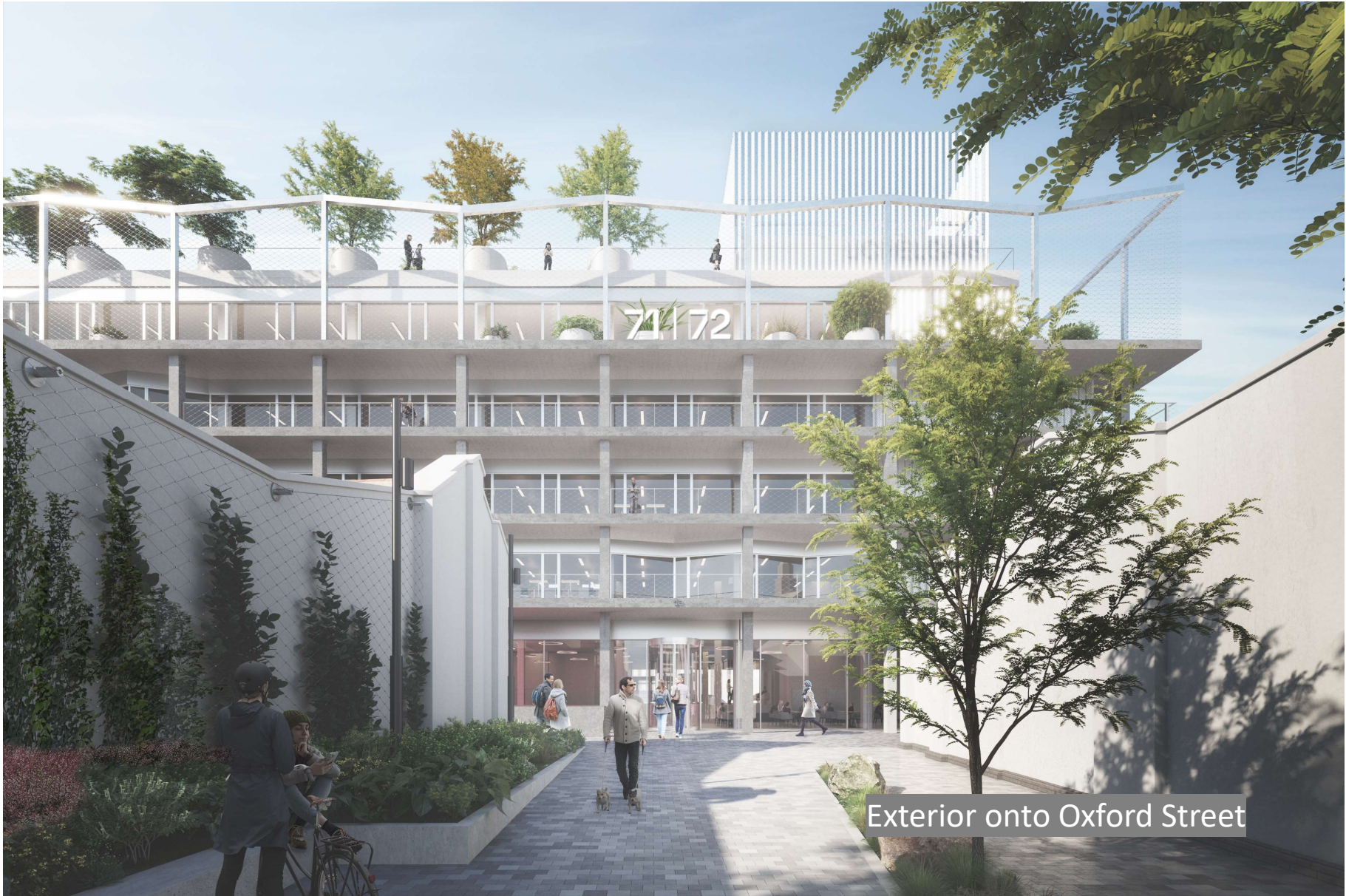
Exterior onto Oxford Street