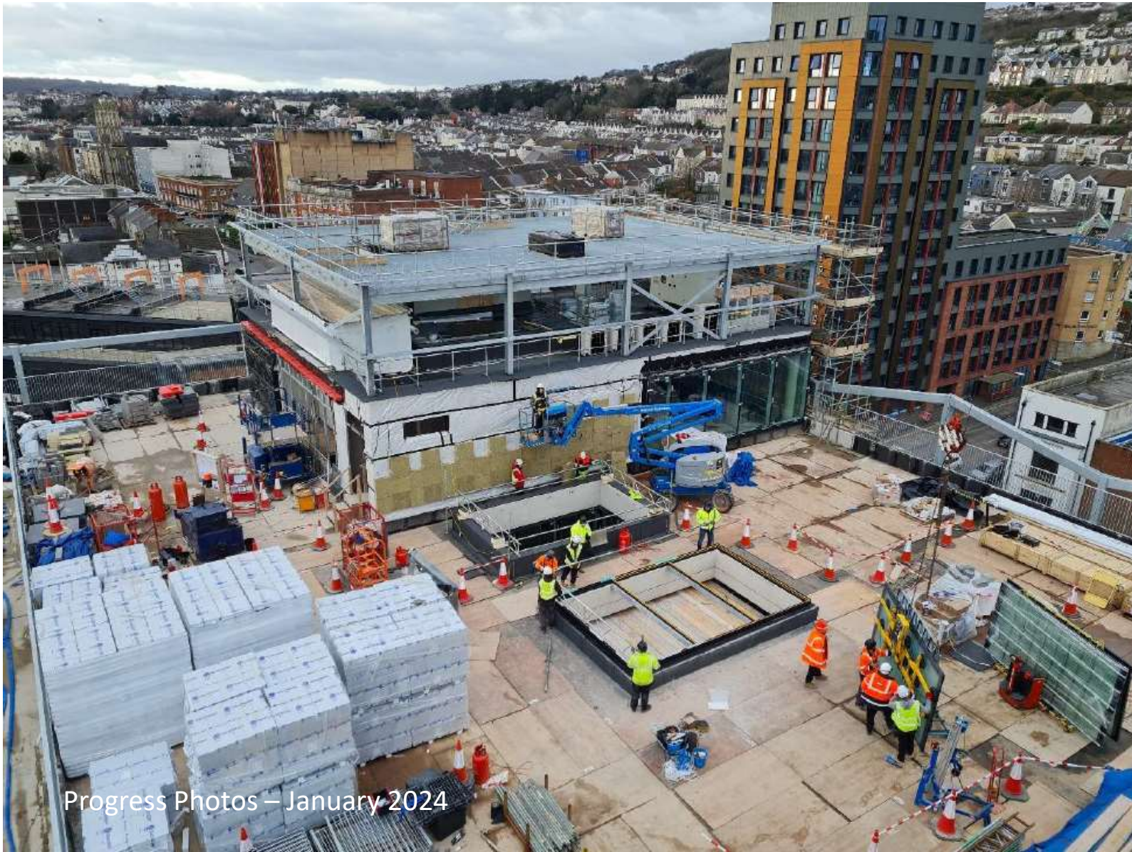
Progress Photos – January 2024